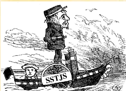
Trader Joe & his crew, setting sail on another culinary adventure.

During the height of tomato season, while supplies are plentiful, we're selling big Beefsteak Tomatoes for 79¢ each – a big value. You'll find them in our fresh produce section.