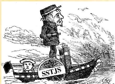
Trader Joe & his crew, setting sail on another culinary adventure.

During the height of tomato season, while supplies are plentiful, we're selling big Beefsteak Tomatoes for 79¢ each – a big value. You'll find them in our fresh produce section.